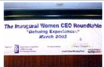
The backdrop banner for the Inaugural Women CEO Roundtable