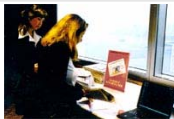
South China Morning Post and SCMP.COM product table