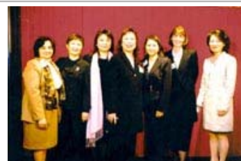
Partners in fund-raising for the