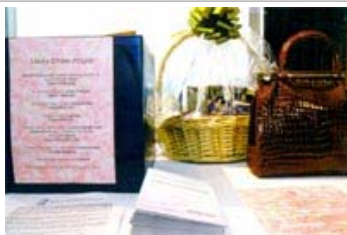
Lucky Draw Prizes included a wine hamper and a KWANPEN Signature Crocodile Bag