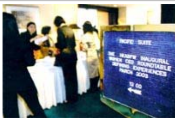
This way to reception