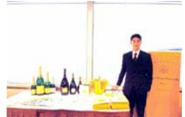
One of the co-sponsors of the event - Veuve Clicquot Ponsardin Champagne