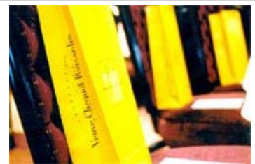
Veuve Clicquot Ponsardin supported the event