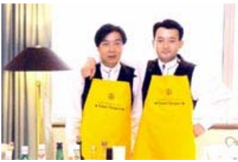
The Veuve Clicquot Ponsardin Champagne servers from the American Club