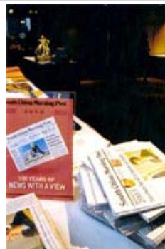
The HKABPW Inaugural CEO Roundtable was also sponsored by the South China Morning Post and SCMP.COM