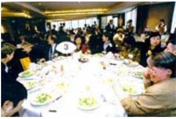
Table No. 3 at the CEO Roundtable