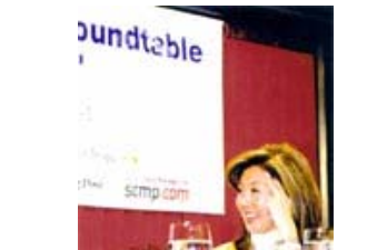
Lorraine Hahn, Moderator, CNN's TalkAsia asked interesting questions